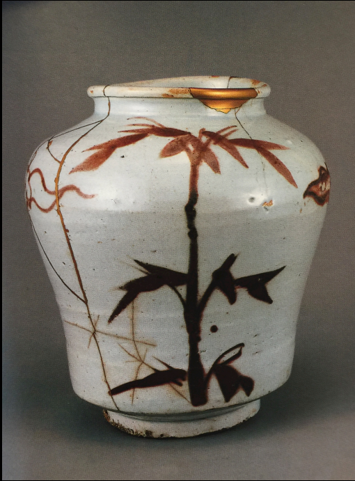
White Porcelain Jar with Bamboo Design Painted in Underglaze Copper Late 18 th century