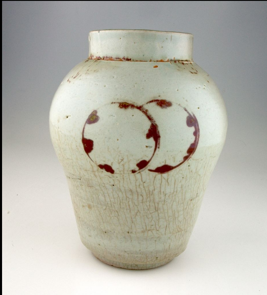
Circular Jar with Broad Shoulders and Interlocking Coin Décor