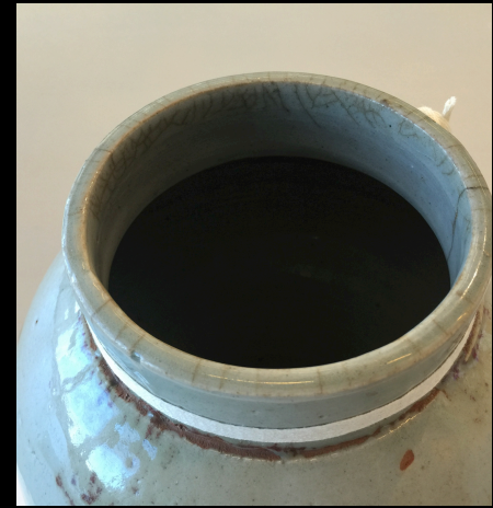
Circular Jar with Broad Shoulders and Interlocking Coin Décor