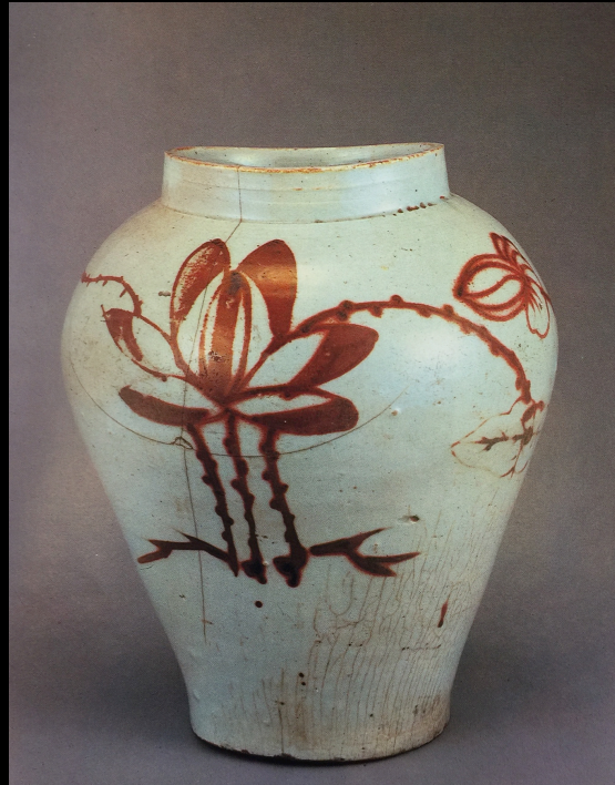
White Porcelain Bottle with Plum and Chrysanthemum Design Painted in Underglaze Copper 14 th -15 th Century