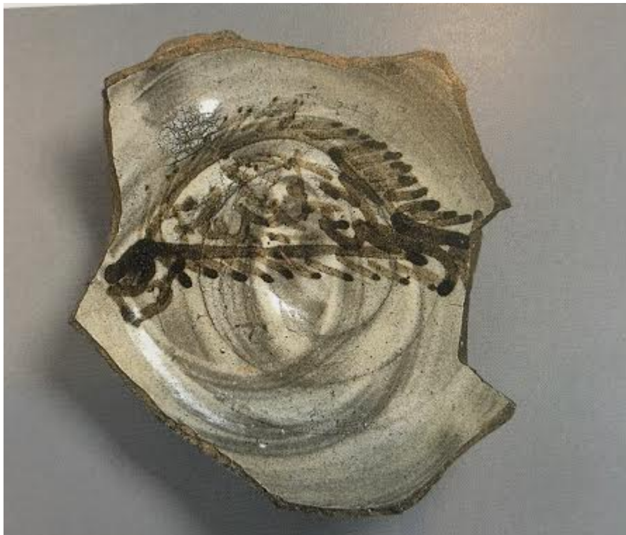
사진 91. 분청사기 철화 어문 접시 粉靑沙器鐵畫魚文楨匙 잔존높이 4.6cm, 저경 4