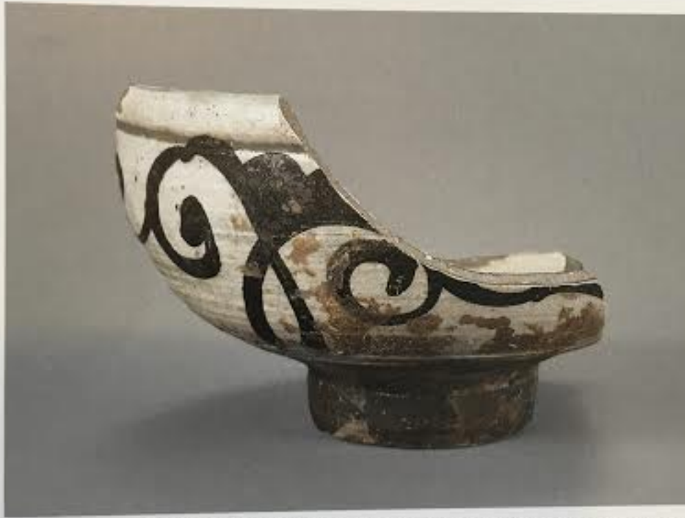
사진 75. 분청사기 철화 당초문 발 粉靑沙器鐵畫唐草文鉢 높이 7.1cm, 직경 4.3cm

Buncheong late 16 th century 계룡시 – Mt. Gyeryong Kilns 7.1cm x 4.3cm